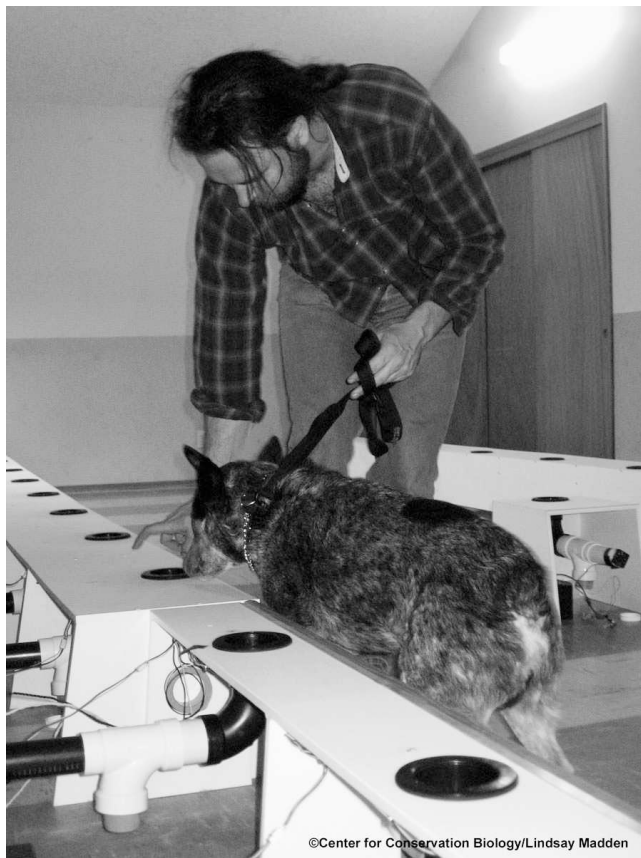
Figure 1. Sample-matching apparatus. The target sample is shown in the single sample rack to the right of the dog. The long racks contain the samples to be matched to the target. Data were collected on maned wolves during 2007 in Seattle, Washington, USA.

the underside of the hole at the short end of the J. We screwed the polypropylene vial containing the sample into this apparatus at the end of a y-shaped pipe, which branched downward away from the hole and connected at the middle of the horizontal section of the J. A small computer fan attached to the end of the horizontal pipe gently blew the scent out the opening of the hole toward the dog (Fig. 1). Keeping equipment clean and using experimental apparatuses that limit opportunities for the dog to contaminate the sample were critical (Schoon 1996, Kaldenbach 1998, Walker et al. 2006). The J apparatus prevented the dog from contaminating the sample by distancing the sample from the dog's nose. The entire apparatus was removable, allowing us to store it along with its capped sample at the end of each day. Each time we replaced a scat sample and pipe combination, we thoroughly wiped down the hole of the matching rack with 10% bleach followed by 90% ethanol. We also disassembled each J-apparatus and washed it weekly in a dishwasher.